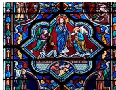
Window of the week 7

The octagon for Christians represents the new day given to humanity at Christ's resurrection, loosening the bondage of death; eight is the number of the New Beginning. The eighth day is the traditional day for Jewish circumcision and the number of people saved on the Ark, who began a new chapter of the human story. Notice the font on the right also has a square base, rooting it in the earth, whilst the octagonal top speaks of the new beginning and the inner circle completes the sacred geometry with unity and divinity.