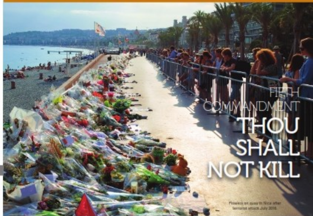
Flowers on quay in Nice after terrorist attack July 2016